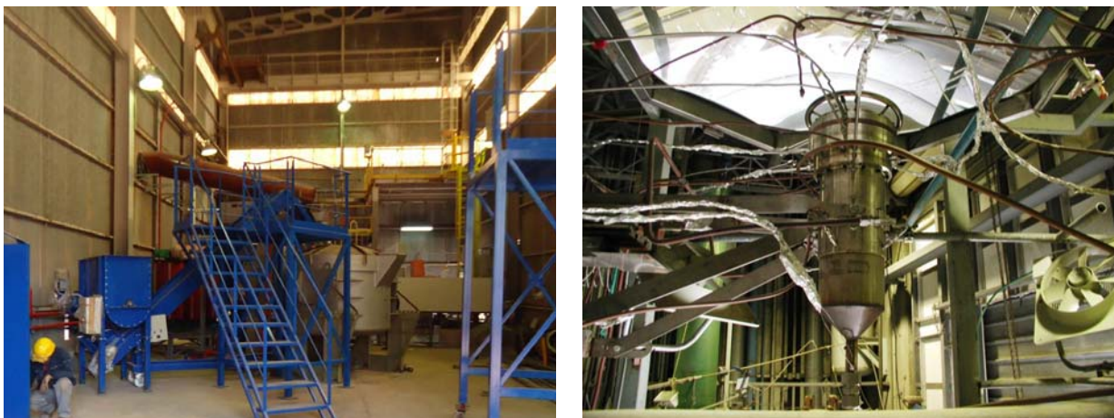
Figure 4-Left: ENEXAL pilot plant in ALSA. Right: Solar Furnace under assembly in WIS.

(f) Assembly of the prototype solar furnace (WP7-Task 7.1): The demonstration of the moderate temperature carbothermic reduction of alumina will take place in prototype solar furnace designed and assembled for this purpose in the facilities of WIS. In the second period of ENEXAL significant advances have been made both in the furnace assembly and in parallel simulation experiments in an induction heating furnace.