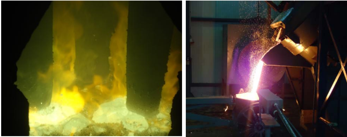
Figure 3: Red mud treatment process experiments in a 400 kVA AMRT-EAF (NTUA)

(e) Erection of the red mud treatment pilot plant (WP5-Task 5.1): To perform the industrial demonstrations of the red mud treatment and the high temperature carbothermic reduction of alumina, a pilot plant is constructed in the industrial plant of ALSA. The heart of this plant is a 1MVA AMRT-EAF, along with the necessary auxiliary systems and fiberization equipment. During the second year of the project ALSA has finished erecting the EAF reactor and within the first months of the third ENEXAL period, the demonstration of the red mud treatment technology will begin.